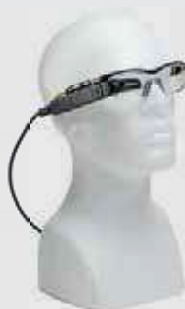
AR100 Safety Frame