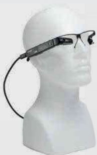
AR100 Lens-less Frame