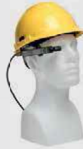
AR100 Safety Helmet Mounts